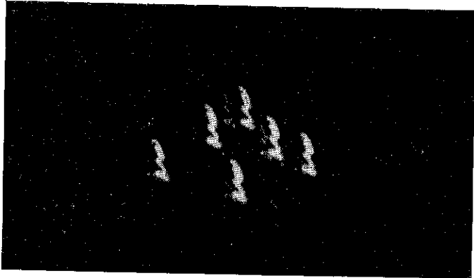
Stormville Pilots Overhead See column two