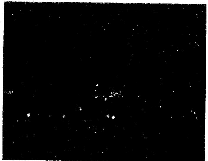
Washington, D.C. photo number two.