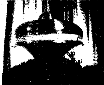
Photo of UFO Model