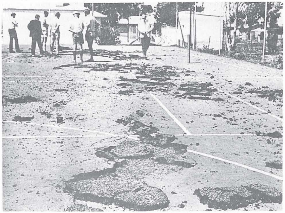
Tennis court where UFO allegedly landed.