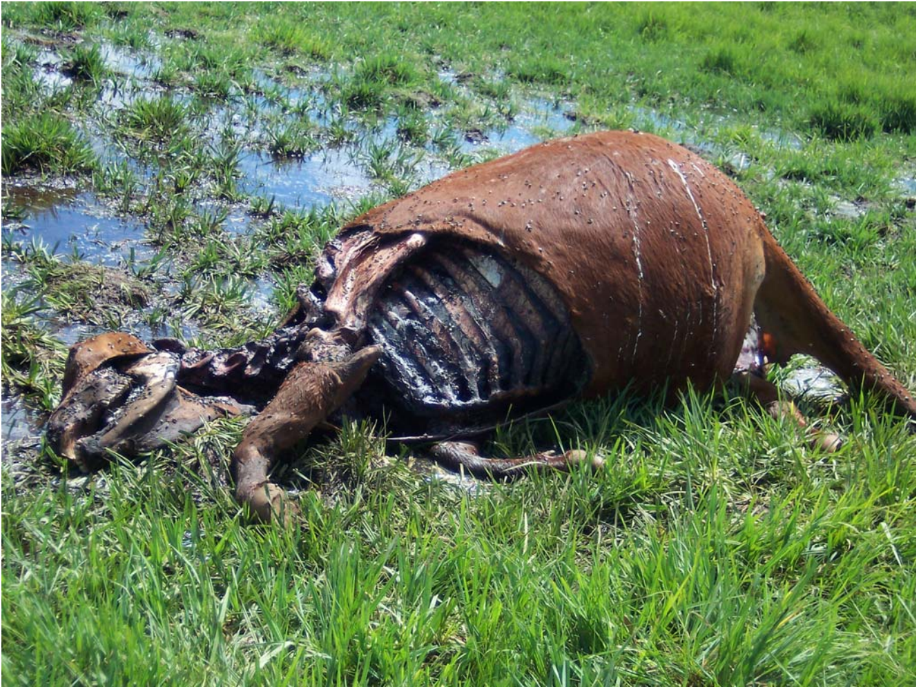
2006 Sanchez Mutilation