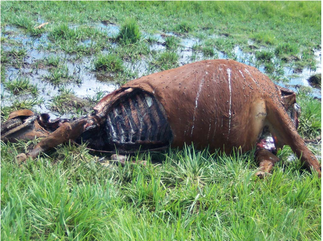
2006 Sanchez Mutilation