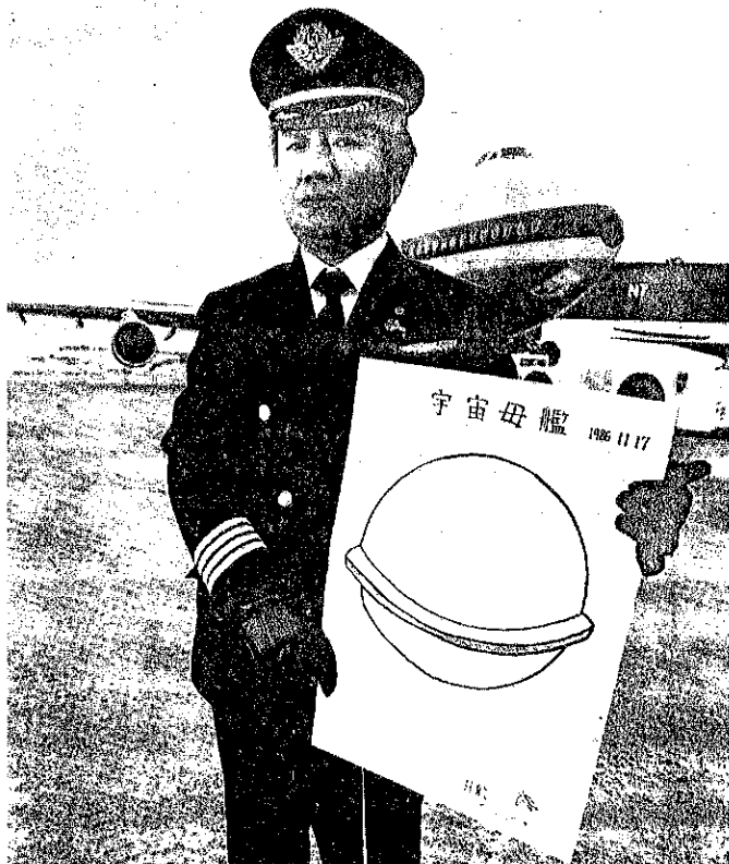
Capt. Kenji Terauchi holds drawing of object he sighted.

Newspapers throughout the world devoted column after column and page after page to a spectacular UFO display over southeastern Brazil on the night of May 19, 1986. Lt. Kleber Caldas Marinho, 25, was flying his U.S.-made F5E fighter plane and came within 12 miles of one of the objects but had to turn back to base as he was running low on fuel.