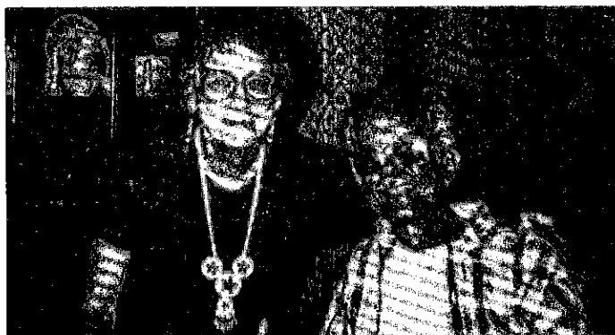
The last photo of the Lorenzens' taken together - fall of 1985.