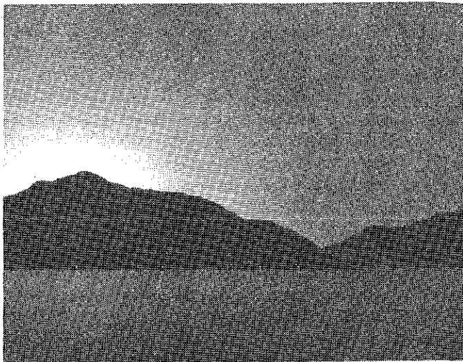
Flash Behind Mountain