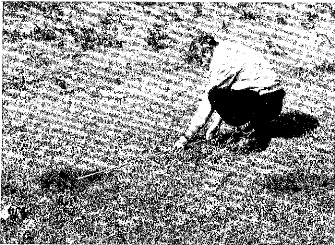
Author Van Der Velde measures pod impressions.

"The object, still flaming, moved at a right angle to the south about 100 meters over a meadow where there was a bull and a horse. It hovered for a few seconds over the cattle bath, then moved northward, overtaking Topo. As Topo ran into the darkness, the object turned back toward me, approaching within 20 meters, paralyzing me and temporarily blinding me. I calculated the diameter of the object to be about three meters. The next thing I knew the brilliant white light turned a vivid red. Slowly gaining altitude, it headed toward the woods where the first object had been seen five days before. Once it reached the woods, it shot into the sky at tremendous speed and disappeared."