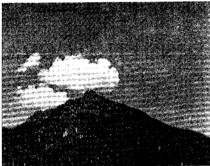
Canadian Photo See Disc, upper right

3. With the right equipment, it is possible to make certain measurements of negative density of the UFO image and of other images of objects at estimated distances from the lens. Here the object is to show that the unknown is not nearby—and thus not a nubcap or other such object thrown into the air. The idea is to measure, from the image of the object at a known distance, the atmospheric "extinction coefficient." On a clear day, with a low value, contrasts between dark shadowed areas and brightly lit areas retain their distinction over greater distances. On hazy days, the light and dark areas blend towards a mid-range shade, giving the appearance that distance mountains have of