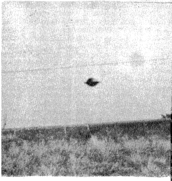
The Passo Fundo Photo

in the back seat for his Kodak Rio Camera which was loaded with color film.