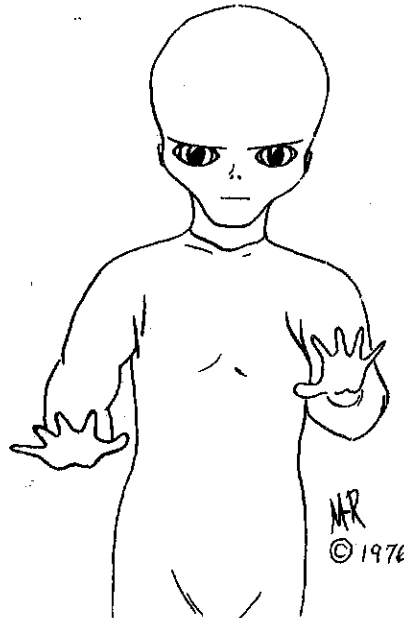
The Aliens in the Walton Case.