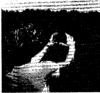
Brad Condon shows relative size of object as it enters Trinity Lake.