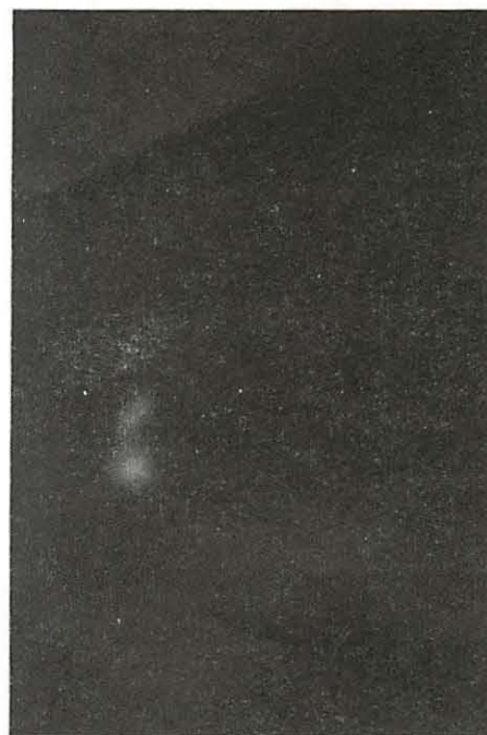
Blowup of Original Photo